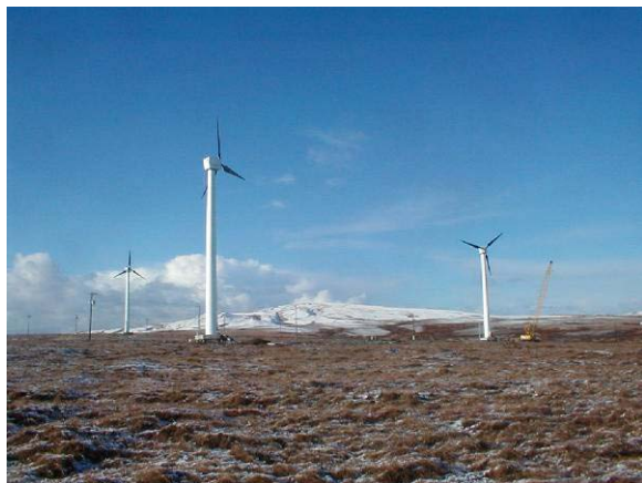
Photo 2: Northwind 100-kW wind turbines at Toksook Bay, Alaska.

The cost of energy in Toksook Bay in 2007 was $0.46/kWh prior to the Power Cost Equalization Program subsidy [18], while the expected power cost (assuming a barrel of fuel at $110) would be closer to $0.77/kWh [20].