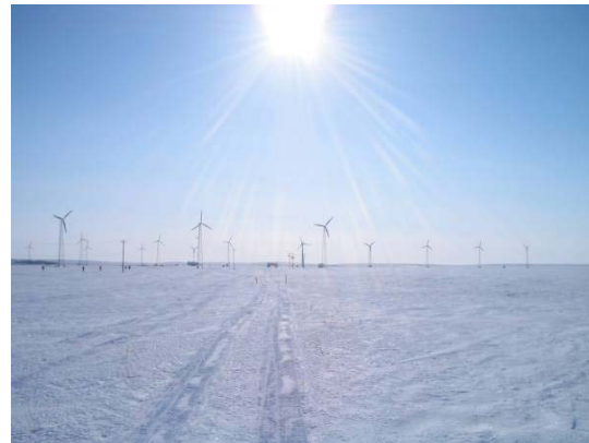
Photo 1: Kotzebue wind farm, Kotzebue Alaska, PIX16098/Ian Baring-Gould.

system capacity, instantaneous penetration up to 100 are clearly possible. Currently only turbine curtailment is used to control at times of high wind output. Data collected by the U.S. Department of Energy (DOE) and the Electrical Power Research Institute through 2004 showed a relatively high system availability of 92%, including wind farm down time due to power transmission outages. Wind turbine availability is used to describe the amount of time that the turbine is in service and able to produce energy. Although more current assessments have not been published, these availability numbers have remained consistent on an annual basis [19]. This clearly demonstrates the ability for turbines to operate in remote communities with high availability, primarily due to the KEA's strong technical capabilities and dedication.