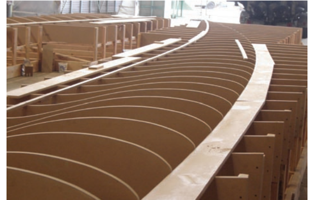
The initial mold fabrication for Knight and Carver's sweep twist blade.

Project Description: Knight and Carver will develop a sweep-twist adaptive blade (approximately 28 m long) to reduce operating loads and allow a larger, more productive rotor. The blade design will use outer blade sweep to create twist coupling without angled fiber. This concept has potentially significant cost and manufacturing advantages. After the design phase, several prototypes blades will be built using a unique fabrication process. Following static and fatigue tests, three blades will be flight tested on an existing 750-kW turbine and resulting data will be compared to the baseline.