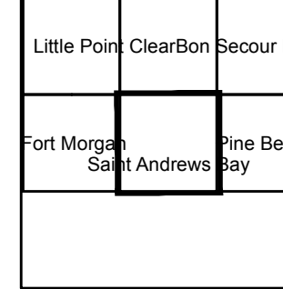
USGS Quadrangle Index